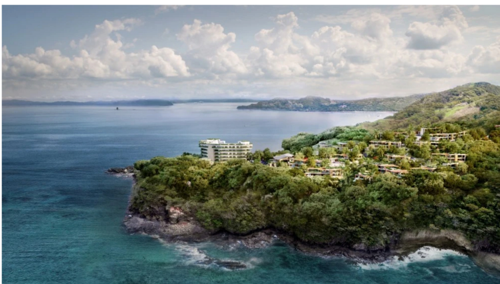
The hotel and residences.

Check out more photos of the Residences Guanacaste below