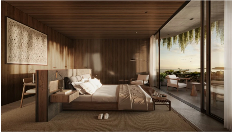
A bedroom. Waldorf Astoria

seamlessly into the surrounding landscape so residents can fully appreciate the steep cliffs, incomparable sunsets and panoramic Pacific Ocean views that make this destination a must-see. Not only has biophilic design been shown to improve the well-being of residents, but it also lends a more sustainable footprint to the development through design improvements in lighting, ventilation and the use of local building materials.”