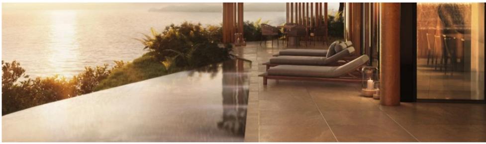
The view from an estate's deck.

“Costa Rica, and Guanacaste specifically, offers a rare opportunity—beautiful pristine land, breathtaking beaches and ocean access, along with a welcoming culture,” Steve Case tells Robb Report . “The region provides unparalleled opportunity for both adventures in nature and experiencing a truly peaceful way of life. The post-pandemic environment has provided amazing opportunities to work from home and live in extraordinary places, and we anticipate seeing unrivaled demand for the lifestyle that Costa Rica can offer.”