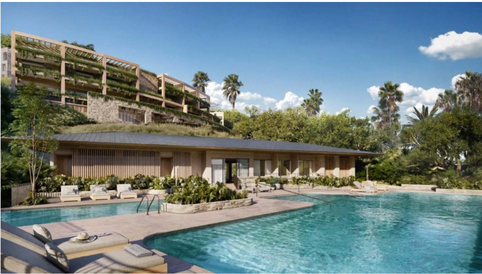
The pool. Waldorf Astoria