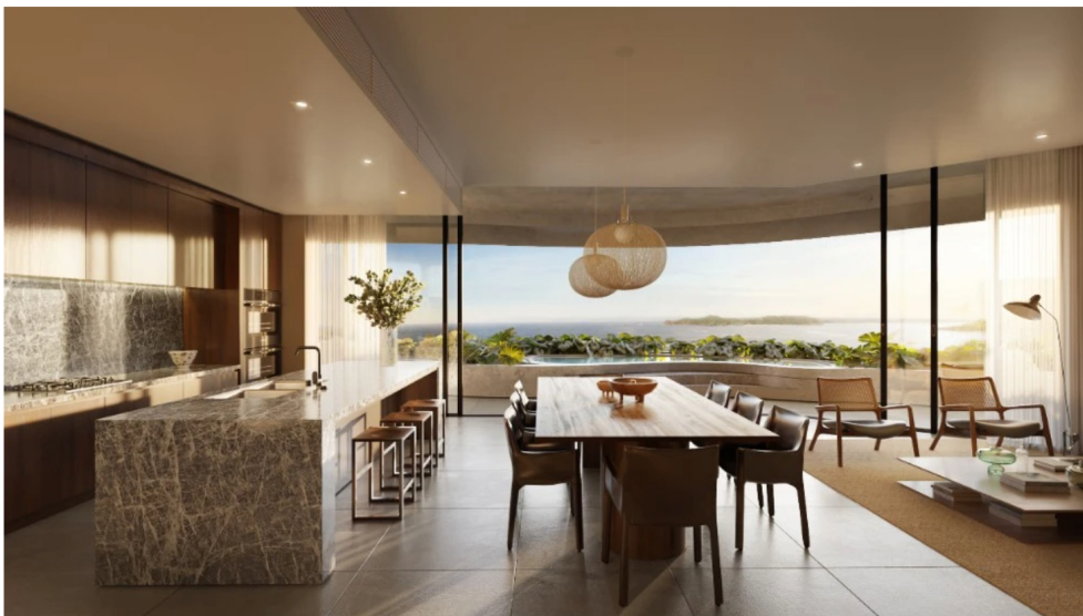
The living room and kitchen. Waldorf Astoria

Set for completion at the end of 2024, the residences are set along the dramatic cliffside peninsula Cacique. Costa Rica is synonymous with sustainability, and Waldorf Astoria will adhere to that with eco-friendly homes that are connected to nature. The residences will feature organic materials and seamlessly integrate the indoors and outdoors for maximum exposure to the surrounding ecologically rich environment. Plans for the residences prioritize biophilic design and high-efficiency heating, cooling and wastewater systems.