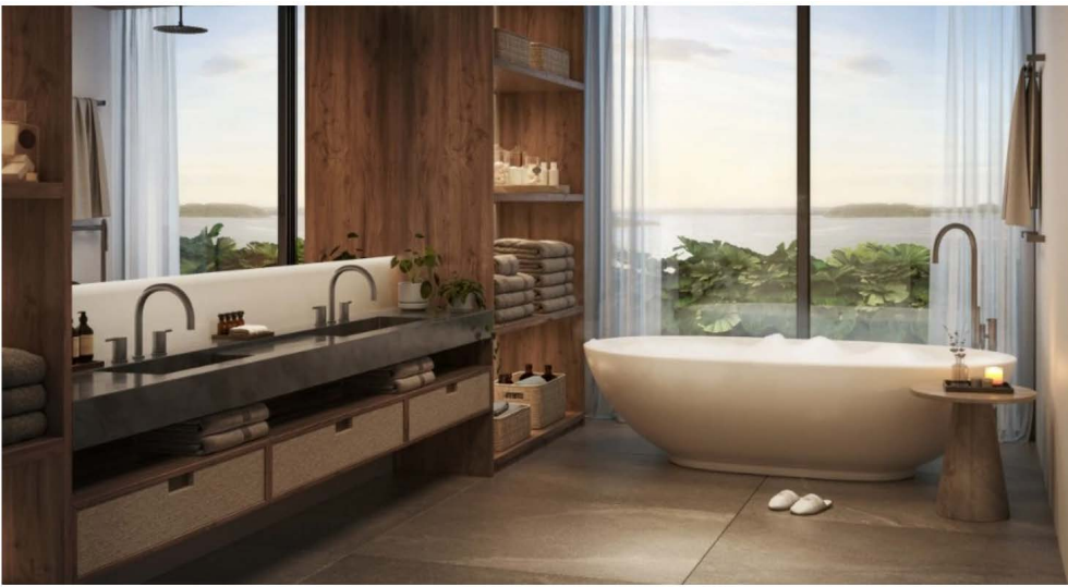
The bathroom. Waldorf Astoria