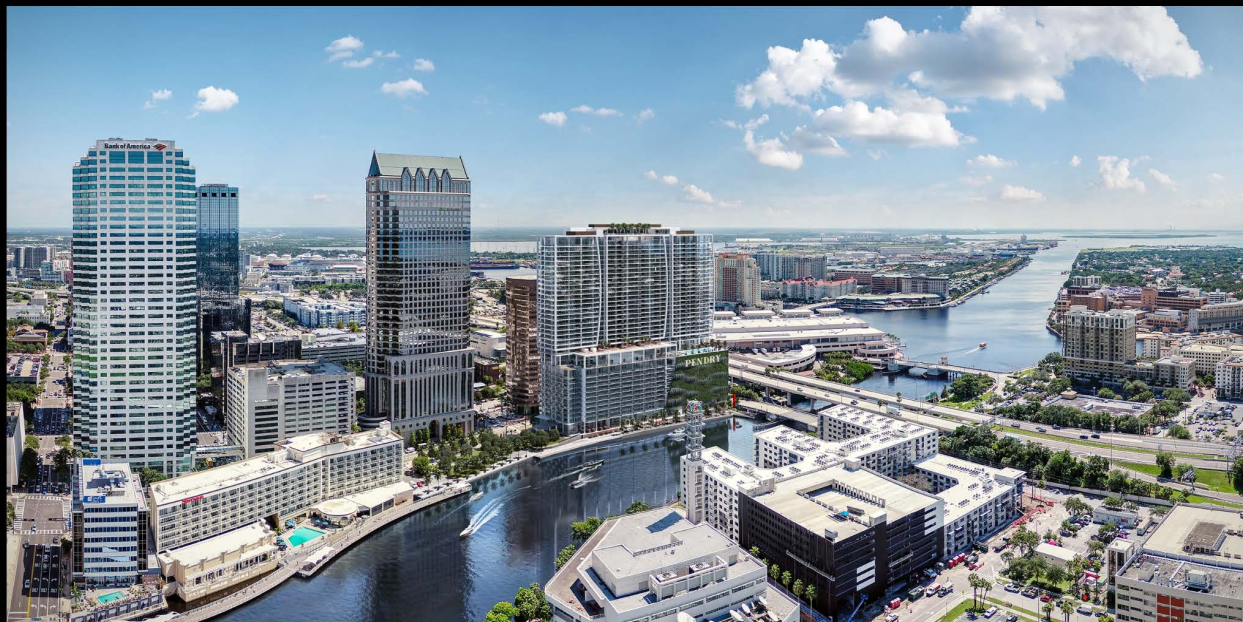
Pendry Residences Tampa in Tampa, FL.

Owners will enjoy access to all the hotel services and amenities of the 149-room Limelight Hotel Mammoth, which encompasses an outdoor pool and hot tubs with cabana seating, a fitness center, on-site ski/bike rentals, a kids lounge, and meeting and event facilities. The residences collection is the first new whole ownership offering in the Village at Mammoth in 15 years and is expected to debut with the forthcoming hotel in the winter of 2024.