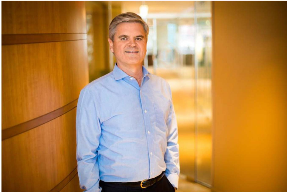
Steve Case (above) believes resorts of the future will be designed with sustainability as a top... [+]

Revolution chose to partner with Cacique Investors LLC and Garnier & Garnier (also the project's Costa Rican developer), who are co-owners in the hotel. It was worth the wait.