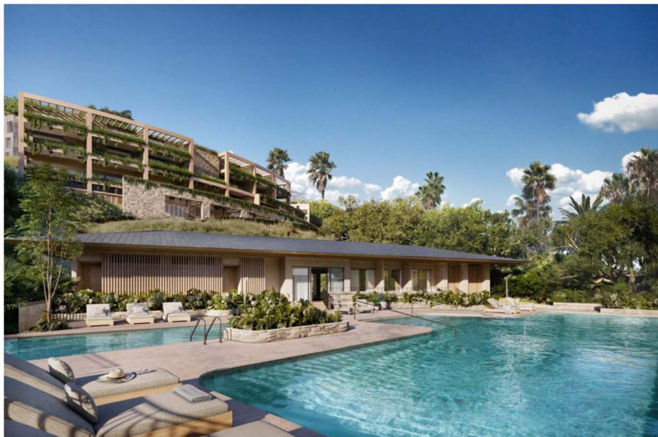
A sprawling holistic wellness center will offer a state-of-the-art fitness center, movement studio, ... [+]